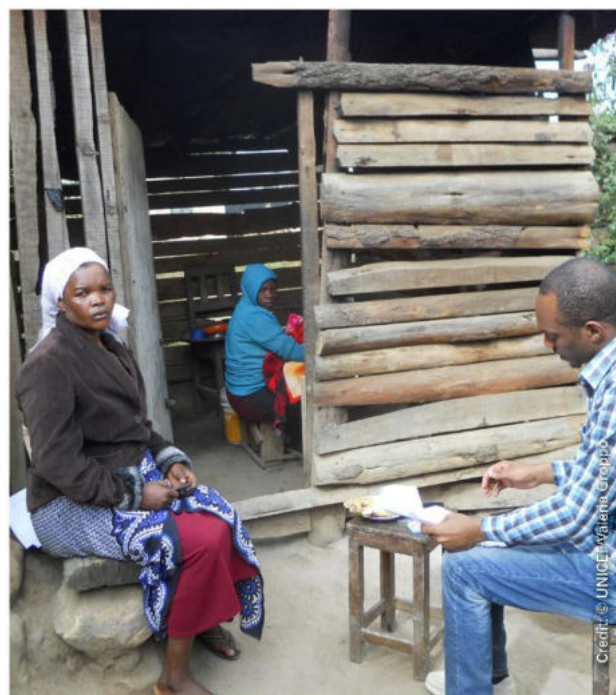
PSSN cash transfer beneficiary, youth and enumerator, Tanzania Adolescent Cash Plus midline data collection, Mufindi council.

To address this, Ujana Salama leverages the impacts of the PSSN with complementary programming, including training and linkages to services to address adolescents' unique vulnerabilities. The goal is to facilitate safe, healthy and productive transitions to adulthood while strengthening local government capacity and services related to adolescent health, livelihoods and social protection. The combination of cash transfers with complementary programming and linkages to services is called integrated social protection or cash plus.