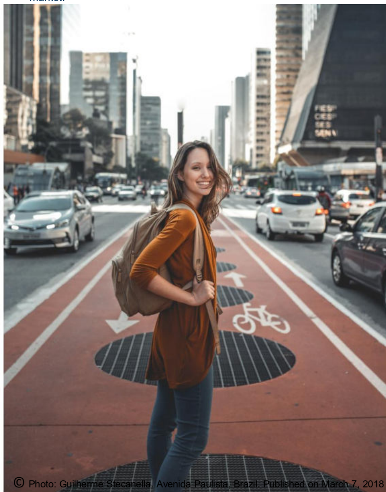
© Photo: Guilherme Stecanella, Avenida Paulista, Brazil. Published on March 7, 2018

In municipalities with women's police stations, improved wage equality led to a reduction in medically registered incidents of violence against women. In municipalities without women's police stations, the opposite occurred: medically registered incidents of violence rose with more equality. This suggests that pro-women institutions are needed to validate women's gains in the labor market.